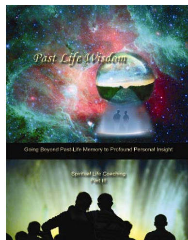
Past Life Wisdom