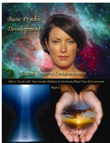
Basic Psychic Development

Raising Extra-Sensory Consciousness This is part of a series of three programs to enhance the development of spirituality. They may be taken together or individually. Each takes the learner into a deeper and different level of sensory discovery. A certificate of achievement accompanies each program level, however, complete of all three modules for a professional Spiritual Life Coach Certificate from the Working Together Institute.